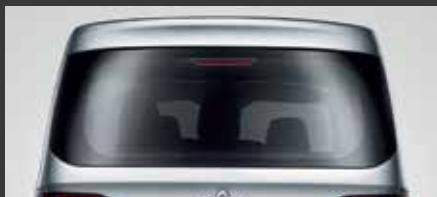
Curved Rear Glass