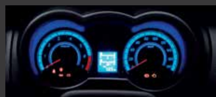
Alluring Monochrome Cluster Meter