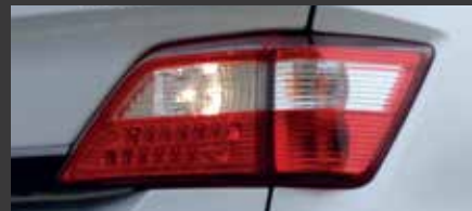
Attractive Rear Lamps