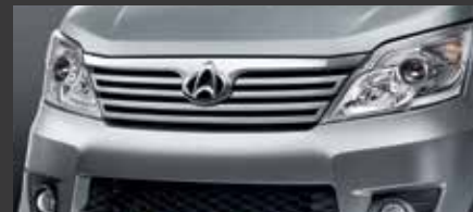
Sophisticated Front Chrome Grill