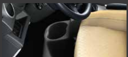
Practical Cup Holder