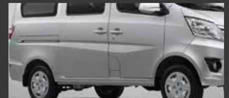
Beautiful Character Lines