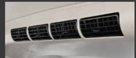
Powerful Dual AC