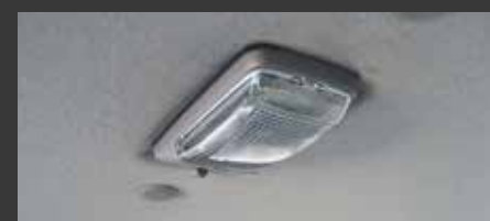
Bright Room Lamp