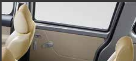
Second Window Roll Down