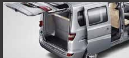
Ample Luggage Space