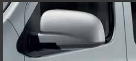
Exquisite Side Mirrors