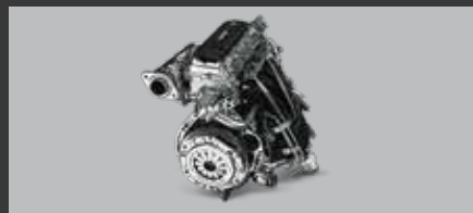
Powerful C-10 Engine