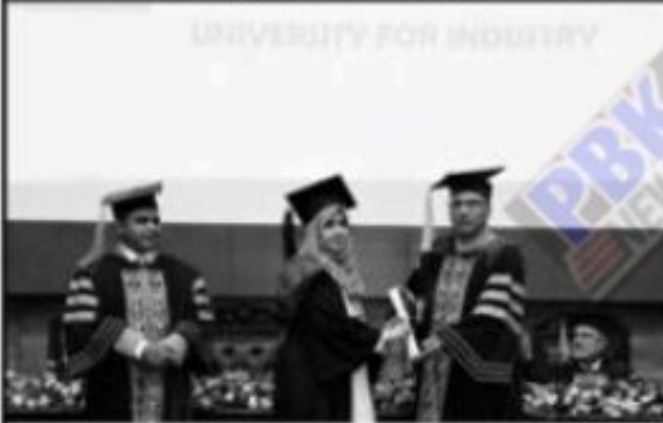
Undergraduate Degree Programs Recognized by HEC, PEC, NCEAC & NTC