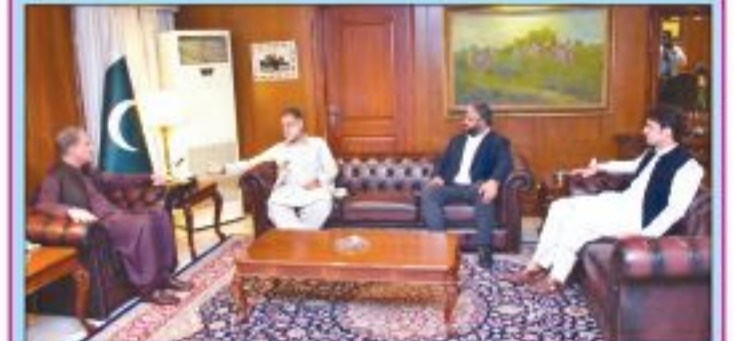
PM AJ&K Sardar Abdul Qayyum Niazi met Foreign Minister Makhdoom Shah Mahmood Qureshi at Ministry of Foreign Affairs.