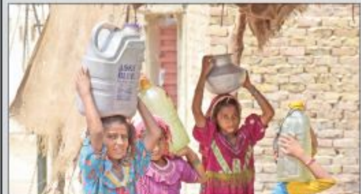
HYDERABAD: Gils carrying water pots going toward home after filling from tube well.