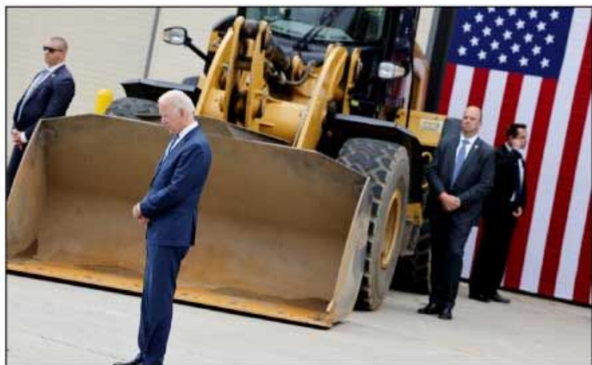
U.S. President Joe Biden looks down before delivering remarks on infrastructure investments at the International Union of Operating Engineers Local 324 training facility in Howell, Michigan.

"They can make a difference in a local conflict on land in Afghanistan. But they don't pose a threat to either the US, NATO