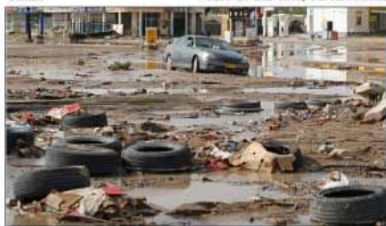
In pictures: Cyclone Shaheen wreaks havoc in Oman, claiming 13 lives

Eleven people were killed as heavy winds and rain swept through the country after tropical storm Shaheen made landfall in Oman.