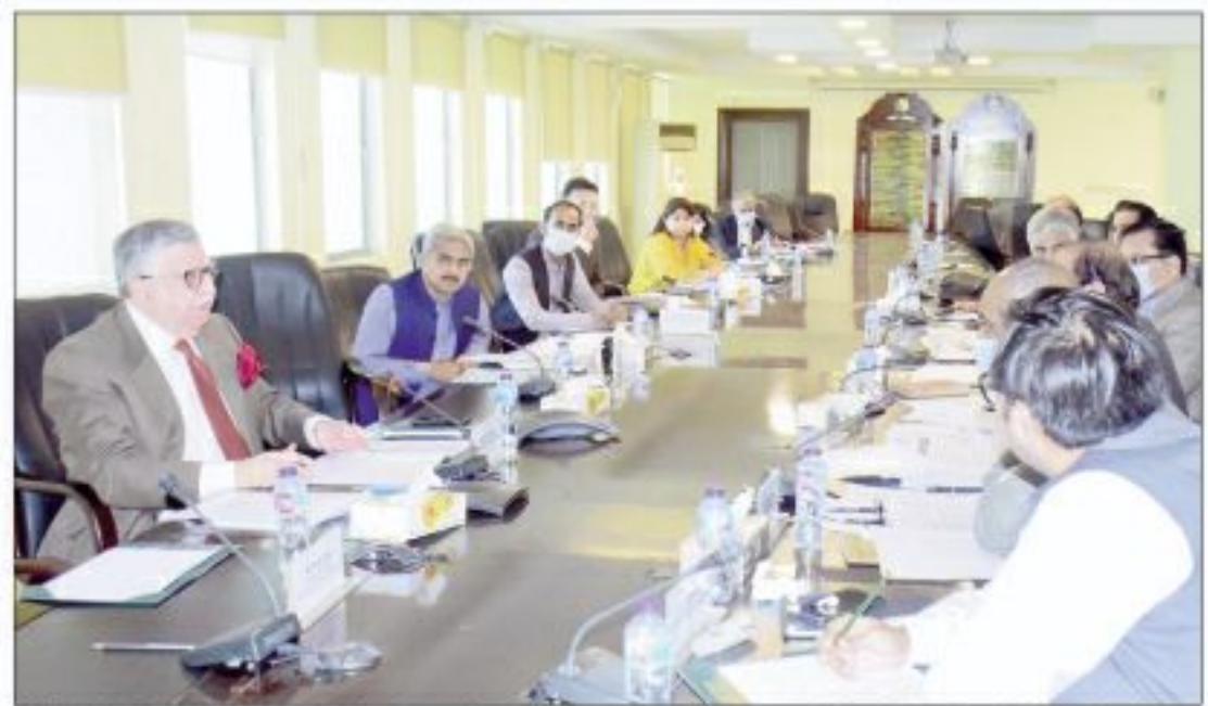
ISLAMABAD: Federal Minister for Finance and Revenue Mr. Shaukat Tarin chairing the meeting of the National Price Monitoring Committee (NPMC) to review the price trend of essential commodities.

He urged that the government should reduce its reliance on loans and try to run the economy with indigenous resources. He further stressed that the government should devise a comprehensive strategy to get rid of the debt burden so that with reliance on indigenous resources, Pakistan could move towards sustainable economic growth. INP