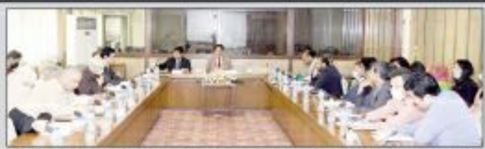
ISLAMABAD: Chairman Standing Committee on Law and Justice Mr. Riaz Fatyana chairing the Committee meeting in Parliament House.