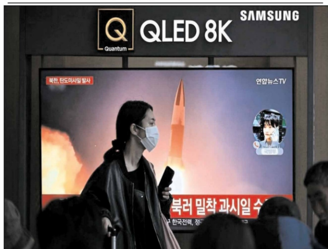
North Korea typically stages missile launches 'as a tit-for-tat' after US-South Korea joint military drills. (AFP)

investigation is going on," Tarun Duggal, deputy commissioner of police in Ahmedabad. "All four injured have been discharged from the hospital, marks a period of religious reflection, family get-togethers and giving for Muslims across the world. (Agencies)