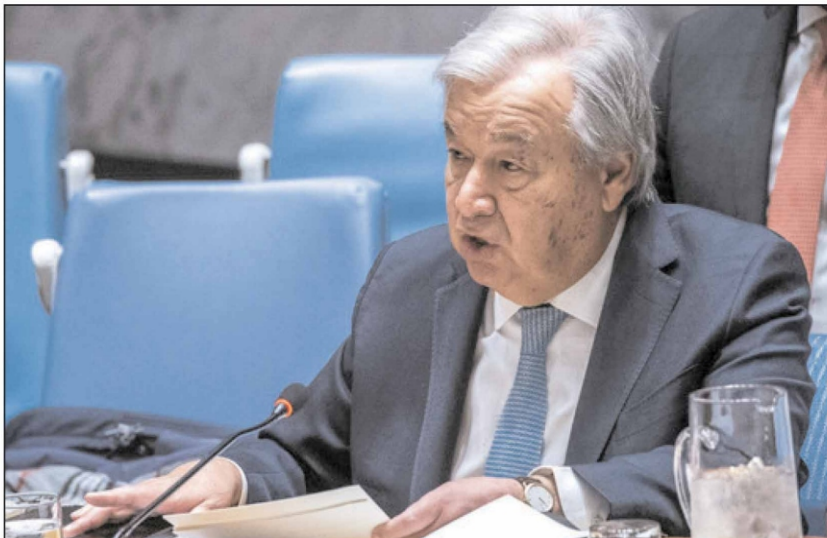
UNITED NATIONS, UNITED STATES: United Nations Secretary-General Antonio Guterres addresses a meeting of the United Nations Security Council on maintenance of international peace and security, nuclear disarmament and non-proliferation, at U.N. headquarters.

UNITED NATIONS, UNITED STATES: UN Secretary-General Antonio Guterres invoked Oscar-winning film "Oppenheimer" on Monday as he warned that the world faced the highest risk of nuclear war in decades. At a Security Council session called by Japan, Guterres said that the biopic about the morally conflicted father of the atomic bomb "brought the harsh reality of nuclear war to vivid life for millions around the world." "Humanity cannot survive a sequel to "Oppenheimer," Guterres said. "We meet at a time when geopolitical tensions and mistrust have escalated the risk of nuclear warfare to its highest point in decades," he said. Russian President Vladimir Putin has made thinly veiled threats to use nuclear weapons as he warns the West against its support for Ukraine, which Moscow invaded more than two years ago. Without naming Putin, Guterres said, "Nuclear saber-rat-