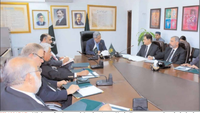
ISLAMABAD: Minister for Law and Justice Azam Nazir Tarar convened and chaired a meeting of Appellate Tribunal Inland Revenue at Law Ministry.