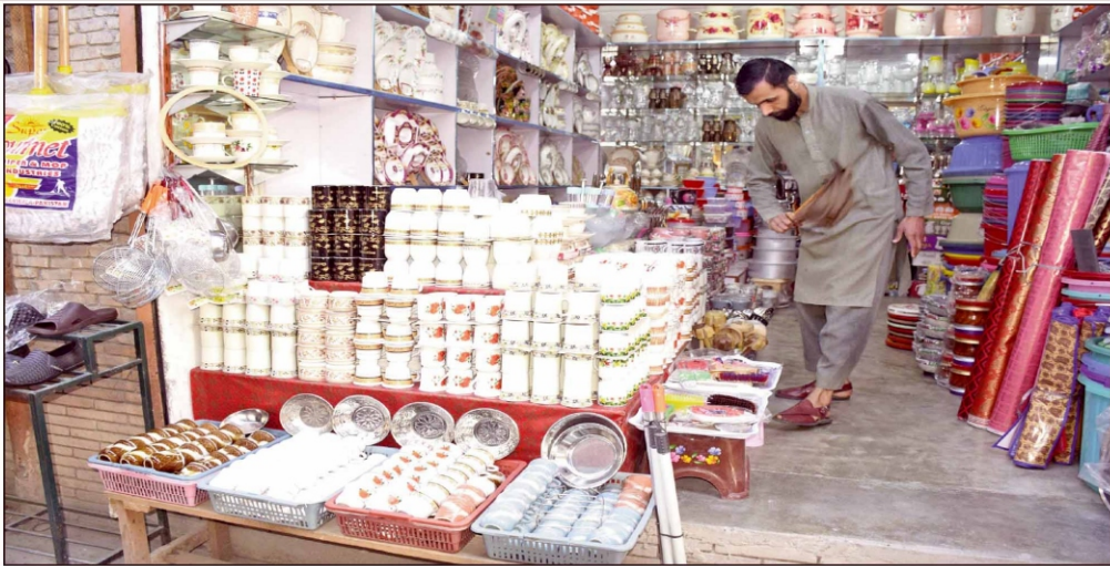
MUZAFFARABAD: A trader is busy in cleaning the utensils in the shop at Imam Bargah Street in the City.

day. Some 341 companies transacted their shares in the stock market; 184 of them recorded gains and 140 sustained losses, whereas the share prices of 17 remained unchanged. The three top trading companies were WorldCall Telecom with 27,822,745 shares trading at Rs.1.38 per share, Telearc Limited with 20,828,617 shares with 9.23 per share and Bank of Punjab with 17,912,724 shares valuing Rs. at Rs.6.14 per share. —APP