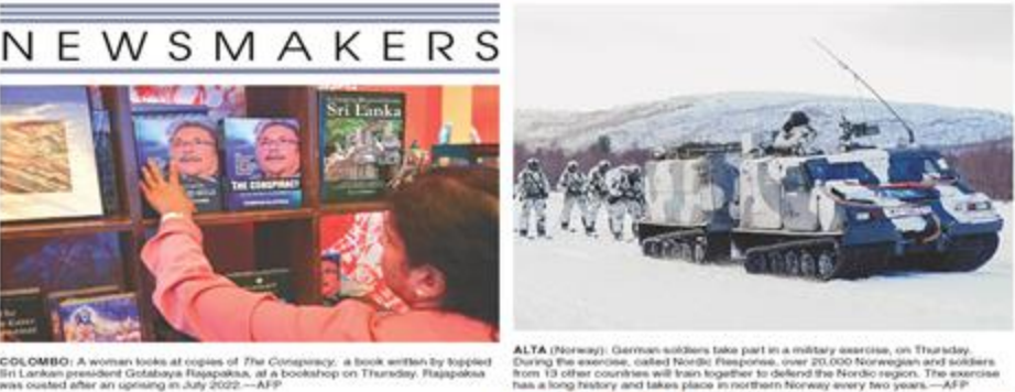
COLOMBO: A woman looks at copies of 'The Conspiracy', a book written by toppled Sri Lankan president Gotabaya Rajapaksa, at a bookshop on Thursday. Rajapaksa was ousted after an uprising in July 2022.