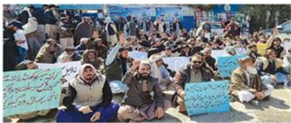
QUETTA: Residents of Kalar Colony and Qasr Colony stage a protest against prolonged gas loadshedding during an ISDG office, on Thursday

The SC on Sept 2, 2020, stated that a judge should not seek pardon. The SC in its decision stated that a judge should not seek pardon. The SC in its decision stated that a judge should not seek pardon. The SC in its decision stated that a judge should not seek pardon. The SC in its decision stated that a judge should not seek pardon. The SC in its decision stated that a judge should not seek pardon. The SC in its decision stated that a judge should not seek pardon. The SC in its decision stated that a judge should not seek pardon.