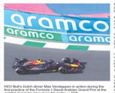
RED Bull's Dutch driver Max Verstappen in action during the first practice of the Formula 1 Saudi Arabian Grand Prix at the Jeddah Corniche Circuit on Thursday