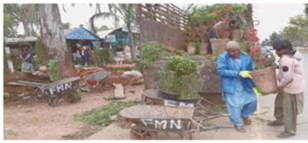
WORKERS at a local nursery offload plants from a truck in H-16 in Islamabad on Thursday.

The report further said that woman lodged a complaint with the police, however, as per the investigation, arrest, and inspection of the crime scene it was revealed that the incident took place at abandoned Road at Doha Town Phase 2, which was located in the DHA. The area which was not located in the limits of Humak Police Station, so the complaint was registered at Daily Diary, it added. — Staff Reporter