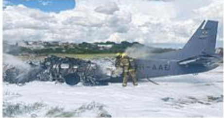
BELO HORIZONTE: Firefighters extinguish a fire after a plane crash on Wednesday. Two people were killed in the accident at Pampulha airport, in Brazil's Minas Gerais state.