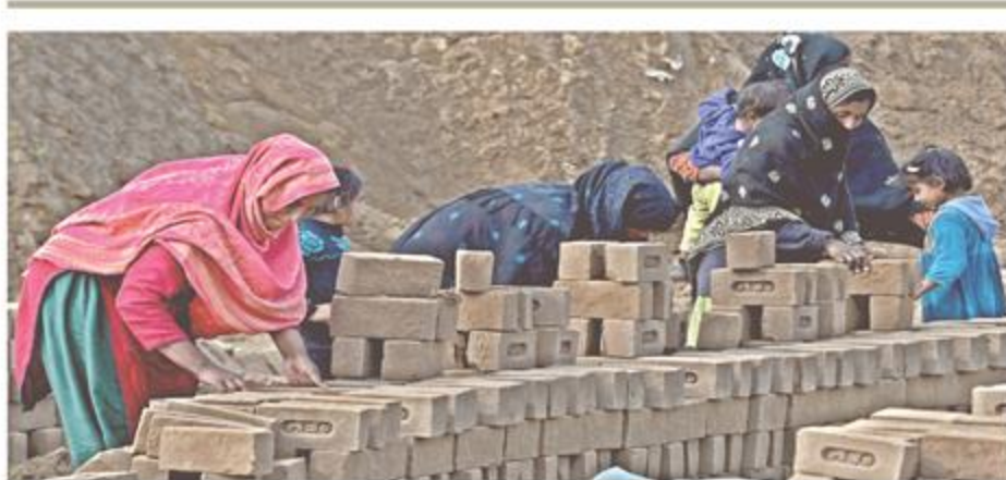
WOMEN work in a brick kiln in H-16 in Islamabad on the eve of International Women's Day being celebrated on Friday.