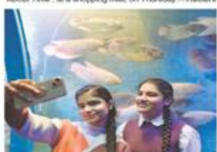
AMRITSAR: Visitors take a selfie picturing fishes at a turtle aquarium, on Thursday.