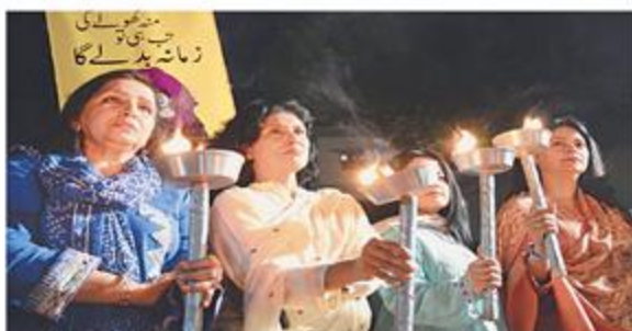
HYDERABAD: Women hold a torch rally in Qasimabad in preparation for the Azad Azadi March, scheduled for today (Friday) — International Women's Day. The theme for this year is 'Inspire Inequal'

On Thursday, the SJC explained that allegations were levelled against judges of the Supreme Court and high courts and that the same had been put forward. Several judges have expressed concern that if they respond to such allegations, their response might be construed as misconduct because Article V of the Code of Conduct issued by the Council on Page 5