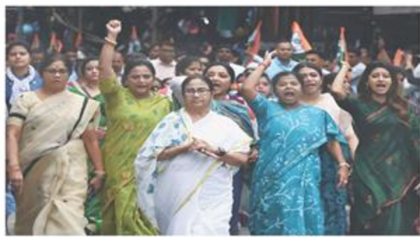
KOLKATA: West Bengal Chief Minister Mamata Banerjee (background center) leads party members during a march on the eve of the International Women's Day.—AFP

The so-called Steele dossier sparked a political firestorm when it was published just before his inauguration in January 2017. It contained unverified and controversial information about Trump and Russia that the former Republican leader has repeatedly denied, including allegations of sexual misconduct. It included claims that Trump had been "summersed" by the Russian FSB security service and that Russia had videotaped Trump with prostitutes during a 2013 trip to Moscow. It also alleged that Russian President Vladimir Putin "supported and protected" an attempt to "subvert" Trump as a presidential candidate for "at least five years"—AFP.