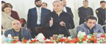
PM Shehbaz Sharif speaks during a reception held in honour of coalition parties in Islamabad, on Thursday.